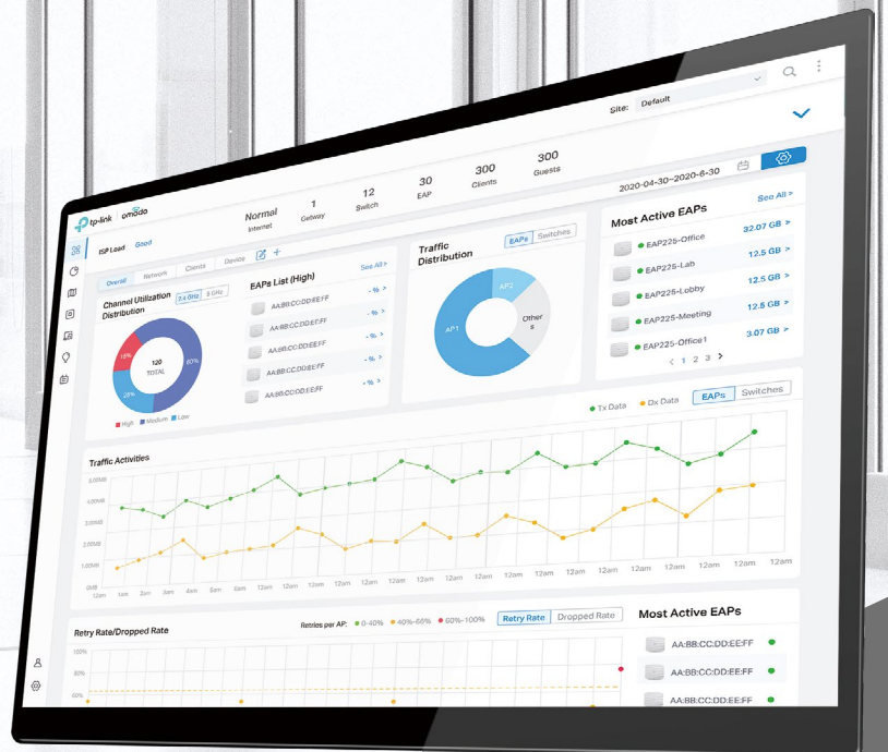
Omada Pro SDN Controller